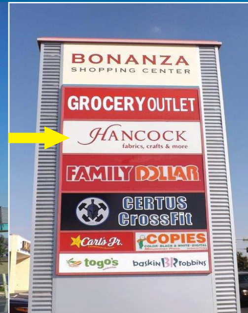
Monument Sign on Shaw Ave.