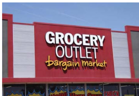
Grocery Store Anchored